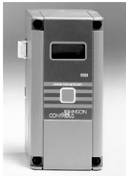
Figure 1: System 350 Display Module

As are all System 350 products, the display modules are housed in a NEMA 1 high-impact thermoplastic enclosure. The modular design provides easy, plug-together connections for quick installation and future expandability.